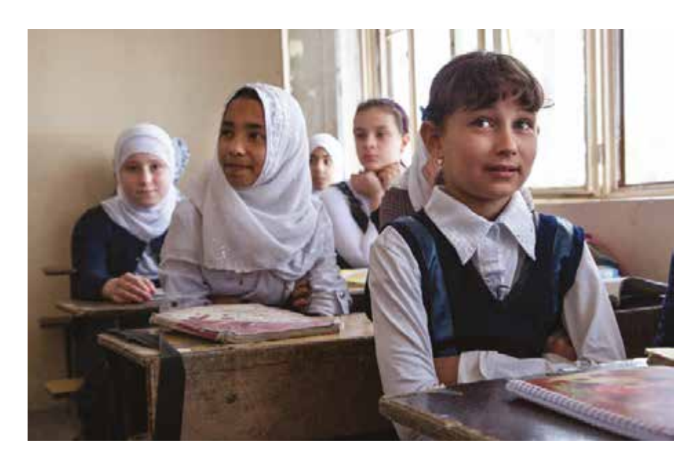
IDP girls attend a public school in Kirkuk.

Both female and male youths of all ages spoke of education as being the most important thing in their lives. However, education was consistently listed as a key challenge, with a variety of barriers inhibiting access. Key barriers for not being able to access education were not enough schools, schools were located too far away from where the youths lived, classes were not culturally appropriate, not enough Arabic language schools, and they lacked the required documents for school registration. Youths also spoke about physical punishment at school, unprofessional