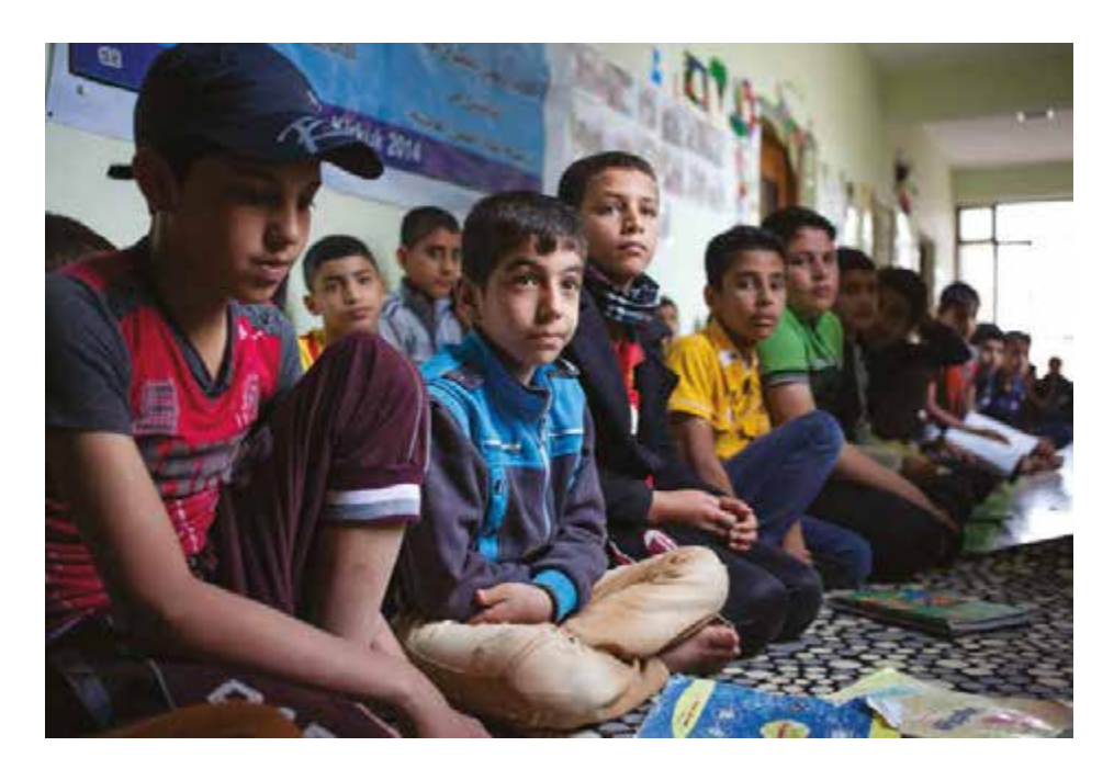
IDP children attend nonformal education classes at Save the Children's centre in Kirkuk.